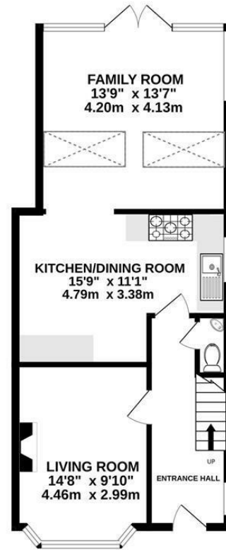
GROUND FLOOR 616 sq.ft. (57.2 sq.m.) approx.